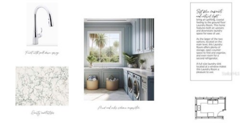
ANGELA RODRIGUEZ INTERIORS Laundry Room 3550 FLAMINGO AVE DESIGN CONCEPT MAY 2024 page 11