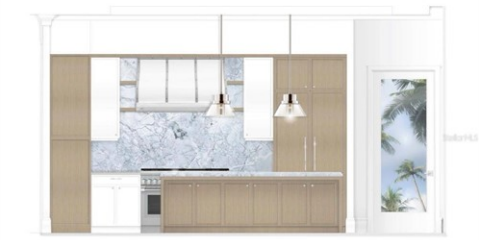
ANGELA RODRIGUEZ INTERIORS Kitchen 3550 FLAMINGO AVE DESIGN CONCEPT MAY 2024 page 9

Sales Office 1605 Main Street Sarasota, FL 34236 (941) 951-6660